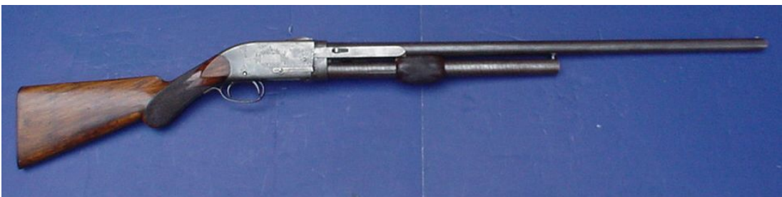
USA, Spencer Pump Shotgun Mod. 1882, Pump Action, 5 shot Tube Mag under barrel, 12 ga, 9 lb.