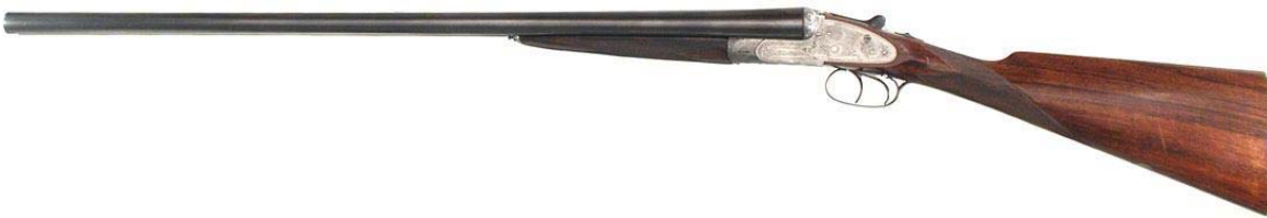
England, Bozard & Co. Dbl. Shotgun, 1880, 1 shot per trigger, Top Break, 16 ga, 8.5 lb.

Also: Remington Dbl. Shotgun, 1877, 1 shot per Trigger, Double Barrel, Top Break, 30" barrel, 12 or 10 ga, 8.4 or 8.8 lb.